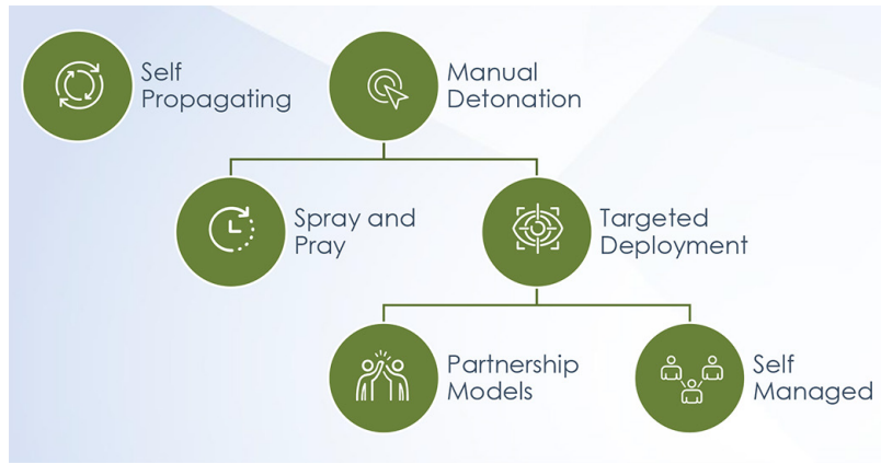
Figure 1: Ransomware operations are tending toward manual detonations and targeted deployments